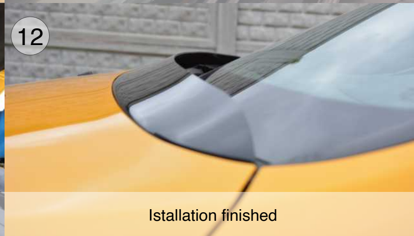
12 Installation finished