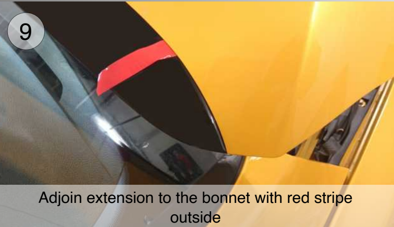
9 Adjoin extension to the bonnet with red stripe outside